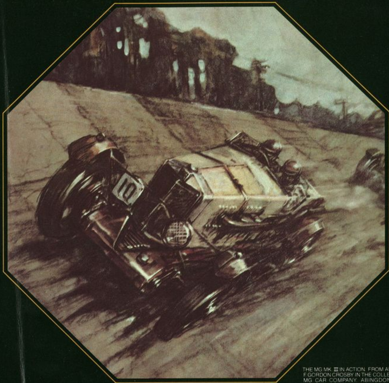
THE MG MK. III IN ACTION. FROM AN ORIGINAL BY F. GORDON CROSBY IN THE COLLECTION OF THE MG CAR COMPANY, ABINGDON-ON-THAMES.